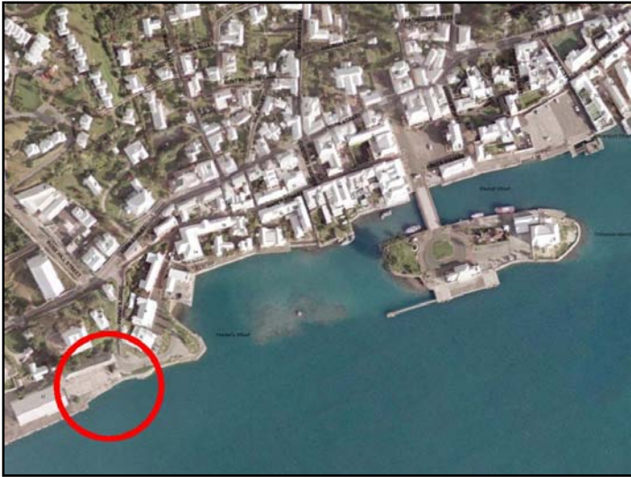
World Heritage Visitors Centre, 19 Penno's Wharf, Town of St. George